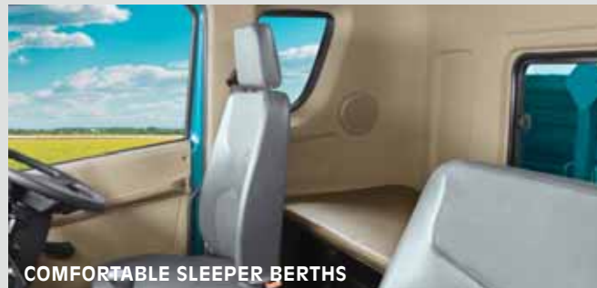
COMFORTABLE SLEEPER BERTHS

Note: In view of our policy of continuously improving our products, we reserve the right to alter specifications or design without prior notice and without liability. Illustrations do not necessarily show the vehicle in its standard form. Accessories shown are not part of the standard equipment. Colour shades shown may vary. E. & O.E.