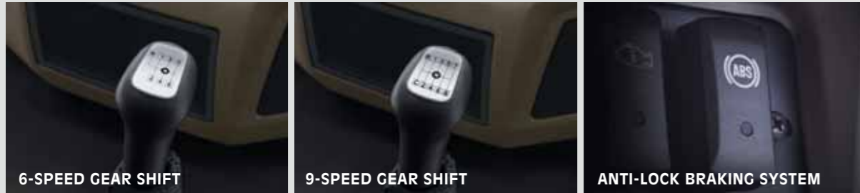
6-SPEED GEAR SHIFT