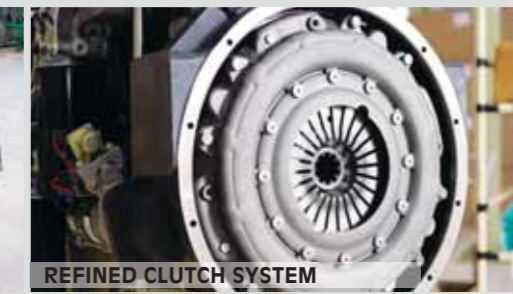
REFINED CLUTCH SYSTEM