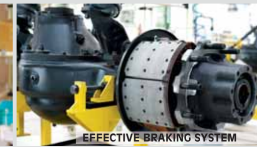
EFFECTIVE BRAKING SYSTEM