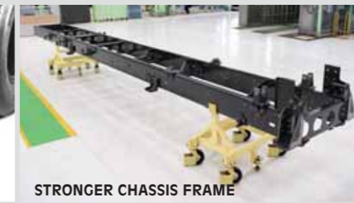
STRONGER CHASSIS FRAME