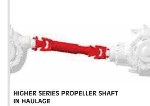
HIGHER SERIES PROPELLER SHAFT IN HAULAGE