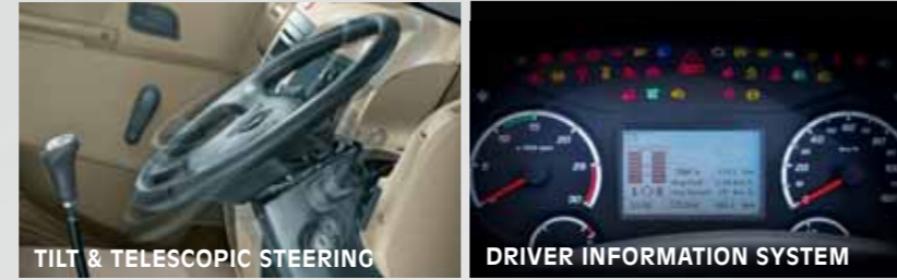
TILT & TELESCOPIC STEERING

Note: In view of our policy of continuously improving our products, we reserve the right to alter specifications or design without prior notice and without liability. Illustrations do not necessarily show the vehicle in its standard form. Accessories shown are not part of the standard equipment. Colour shades shown may vary. E. & O.E.