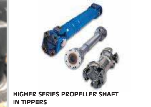
HIGHER SERIES PROPELLER SHAFT IN TIPPERS