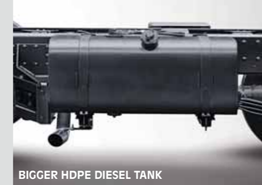
BIGGER HDPE DIESEL TANK