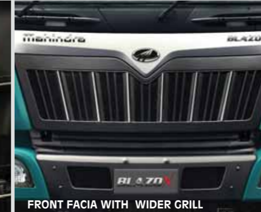
FRONT FACIA WITH WIDER GRILL