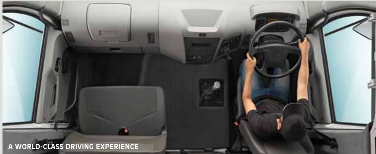
A WORLD-CLASS DRIVING EXPERIENCE

Mahindra BLAZO X is one of the most comfortable truck in India. It's built with the knowledge that drivers are the actual wheels of Indian transport and they spend half their lives inside the cabin. Which is why this truck comes with a host of features to make every drive more safe and comfortable. Like the 4-point suspended cabin that truly enhances driving comfort. And the controls that are ergonomically located to reduce effort inside the cabin.