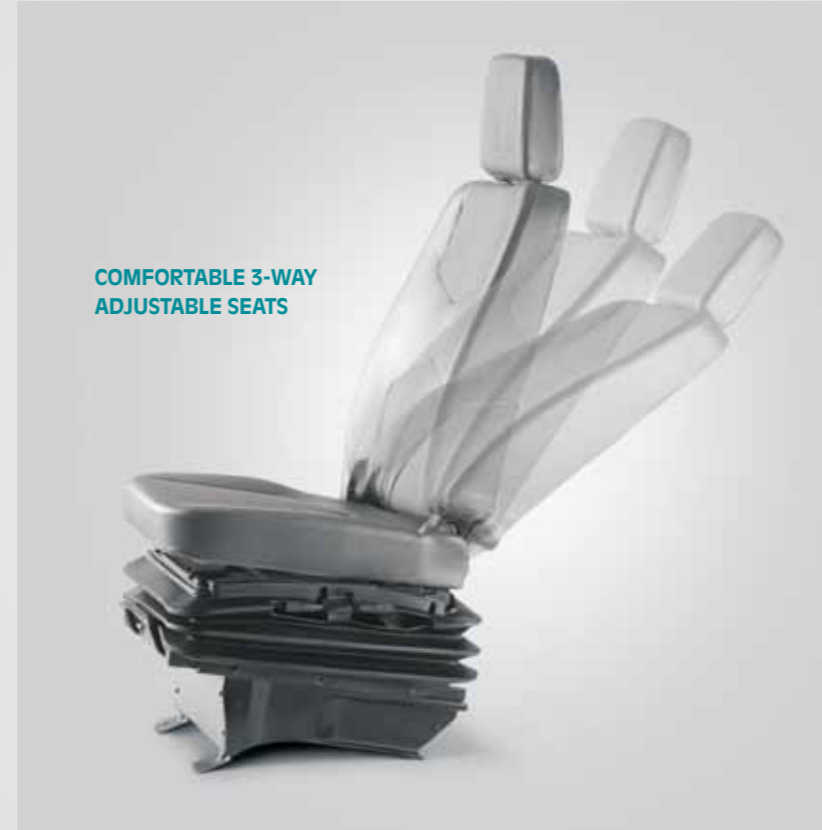
COMFORTABLE 3-WAY ADJUSTABLE SEATS