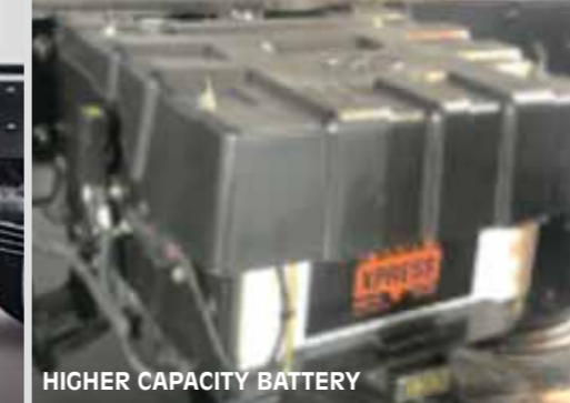
HIGHER CAPACITY BATTERY