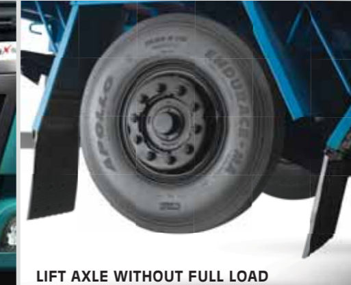
LIFT AXLE WITHOUT FULL LOAD