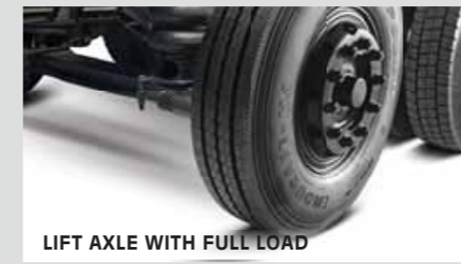
LIFT AXLE WITH FULL LOAD